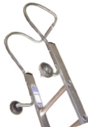
Clow Standard Roof Ladders

Clow Aluminium Roof Ladders are available either as Standard or Extending types.