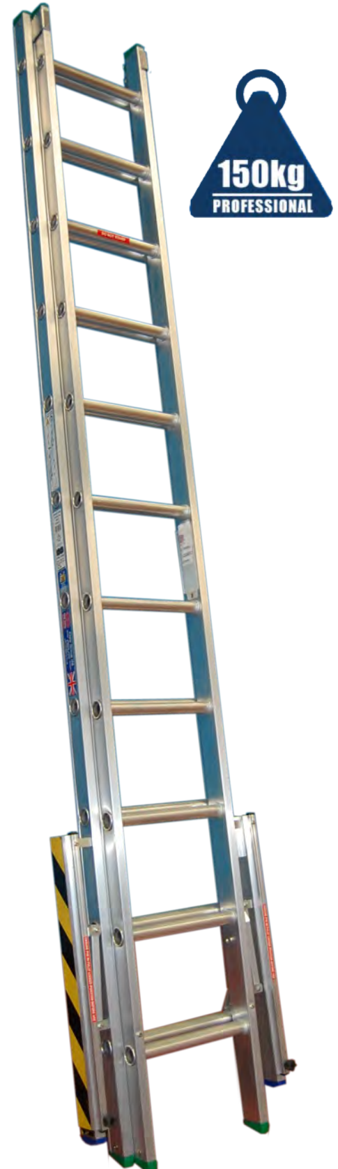
Clow Dual* Section Extension Ladder to EN131:Professional

Deep 'D' shaped rungs for comfort and large angled PVC block safety feet, supported by the heavy duty folding stabilisers make this a strong and robust ladder suitable for use within a wide range of industrial environments.